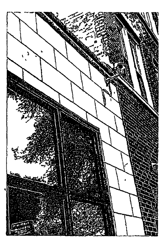
108 foot in length. 05 feet in width and 12 feet above grade level