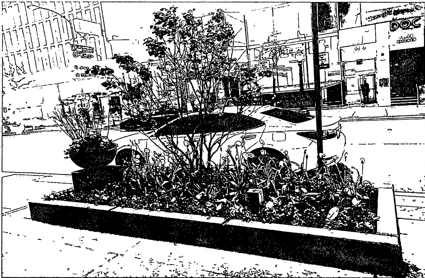
WALTON ST (Qty 2)