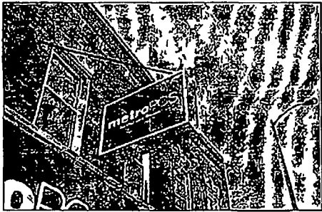
PHOTO ENHANCEMENT - SIGN B