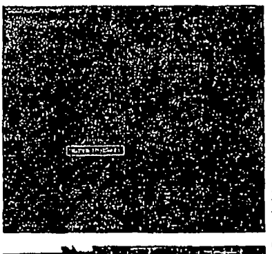
On the correr of Ene and Wells street

Sign to be installed on a timer and dimmor controlled circuit to turn off no later than 11 00 pm