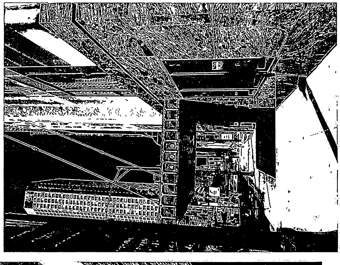
Canopy Permit# 1124495 Account: 377519-2