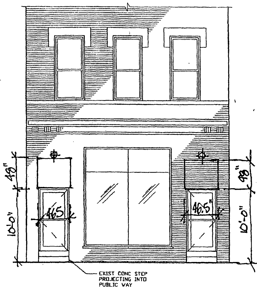
2 PARTIAL PROPOSED EXTERIOR ELEVATION SCALE 1/4"=1'-0"