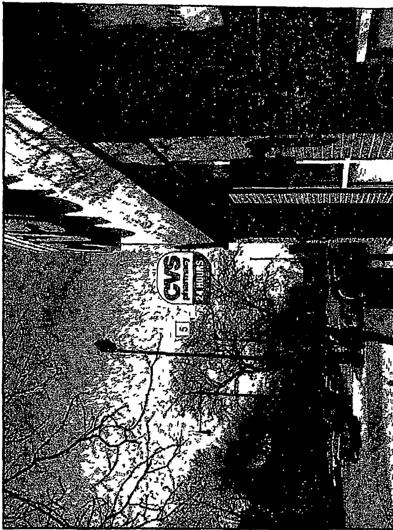
Proposed Signage Elevation

ACCOUNTS/CVS pharmacy locations 2015P roject 75115836 Chicago IL cdr