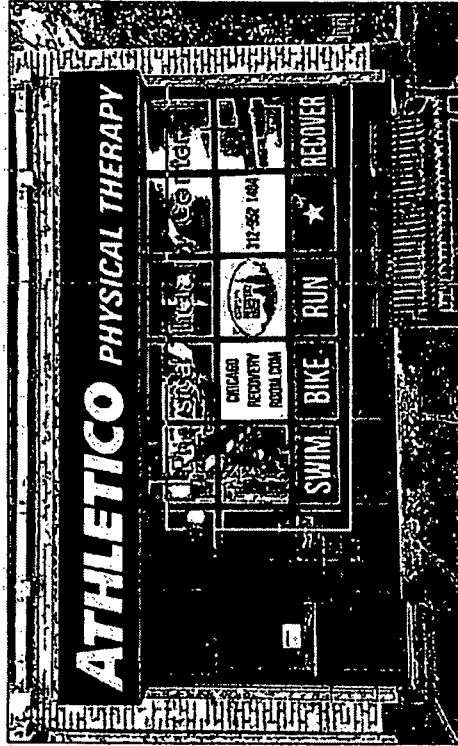
Proposed Sign - SWS To remove any signs installed currently covered by awnings *Remove all window graphics