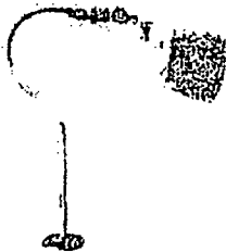
Outdoor Lighting over signage (3)