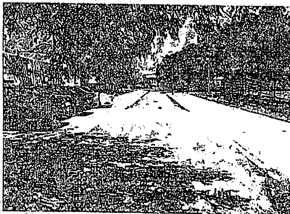
View from W Evergreen