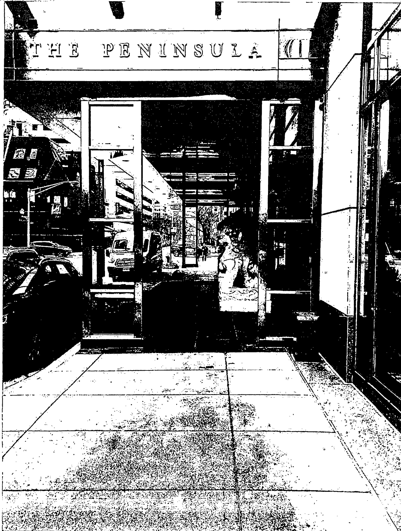
Acct #206313 - Peninsula Chicago Permit #1122718 - Windscreen