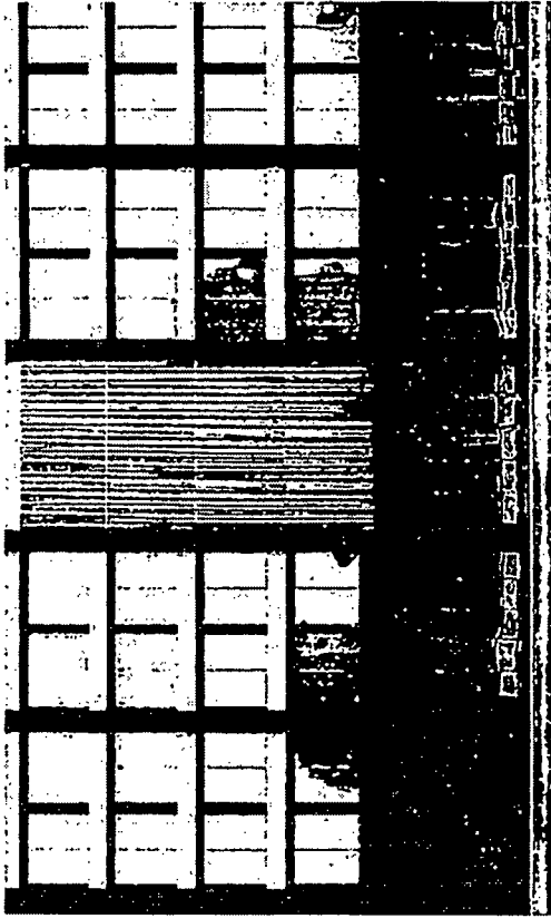
proposed locations (A) & (B)

(B) - GRAPHICS Color: Black Background, White Copy