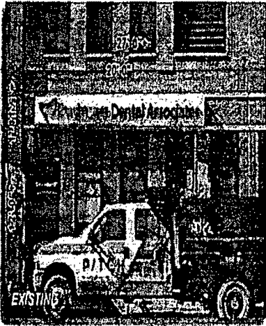
North Building Elevation - Before