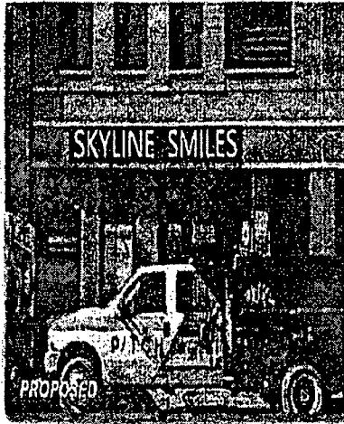
North Building Elevation - AFTER