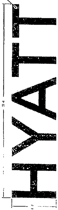
Fig. 2 - Elevation 1/8" = 1'-0"

Polymerized face with constant 3M Dual-Cure Film 4553E 313 to match Fabulous Cool Gray 11 U by 247 and illuminate with by night. Sign face to be custom fabricated.