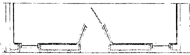
1/8" = 1'-0"

Copyright 2011 by Quantum Global LLC. All rights reserved. No portion of this drawing may be reproduced or transmitted in any form or by any means, electronic or mechanical, including photocopying, recording, or by any information storage and retrieval system, without prior written permission from Quantum Global LLC. PROJECT: QUANTUM GLOBAL LLC DESIGNER: QUANTUM GLOBAL LLC ARCHITECT: QUANTUM GLOBAL LLC ENGINEER: QUANTUM GLOBAL LLC LANDSCAPE: QUANTUM GLOBAL LLC