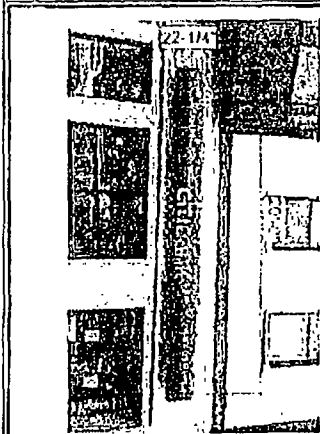
EXISTING PHOTO-SIGN D