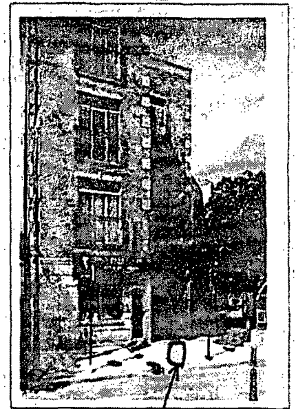
Location of planter