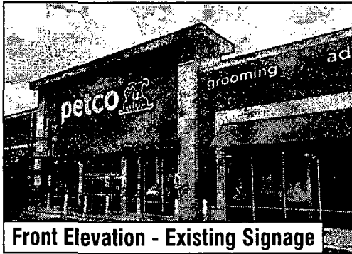
Front Elevation - Existing Signage