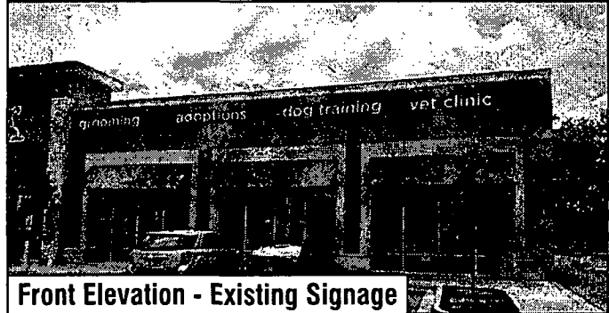
Front Elevation - Existing Signage