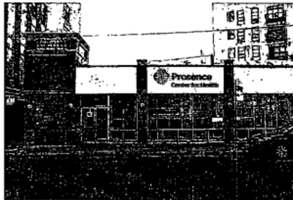
Presence Medical Office Building