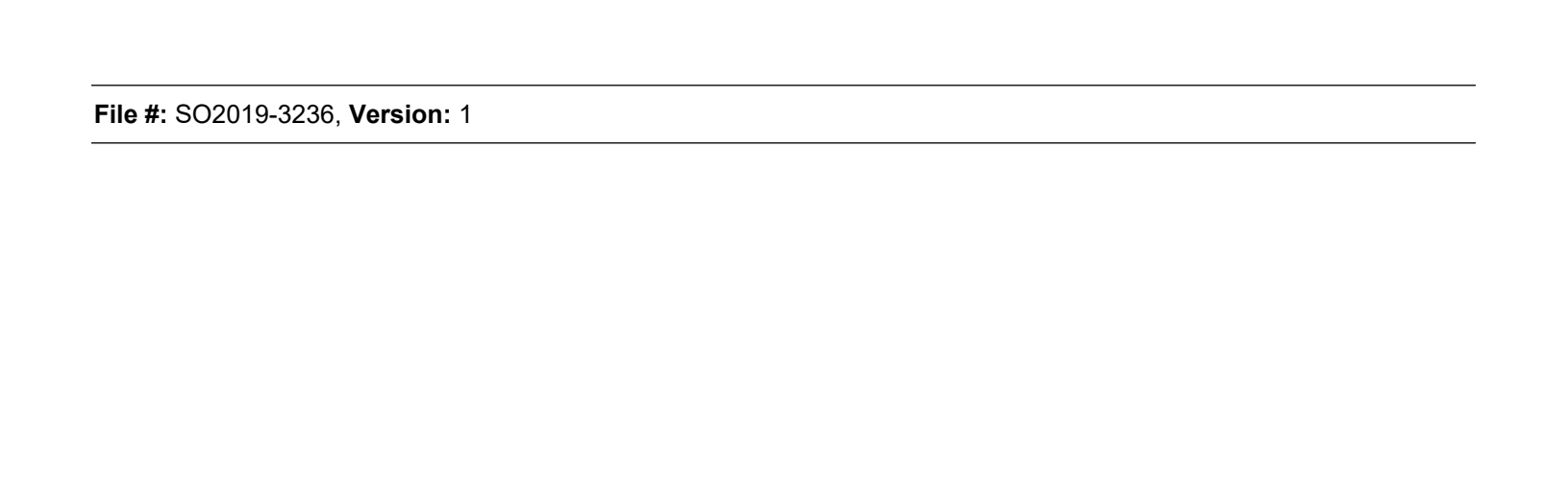
EXHIBIT E CONSTRUCTION CONTRACT

See attached. [NOT ATTACHED FOR ORDINANCE PURPOSES]