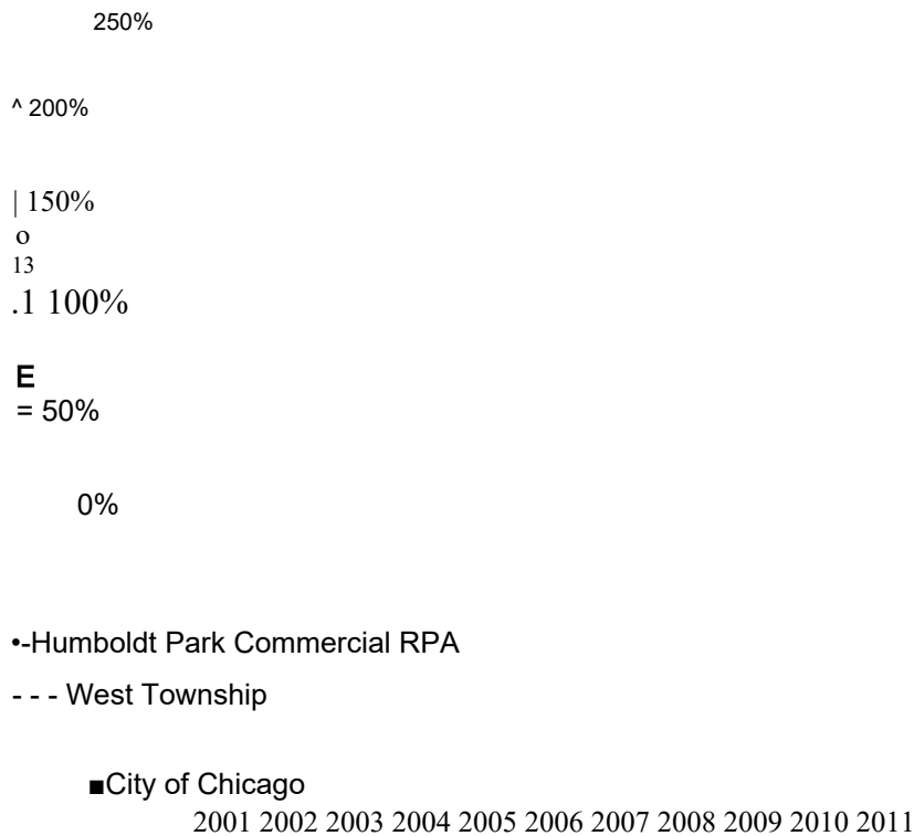
Exhibit 13. Change in EAV from 2001 Baseline

Source: Cook County Assessor's Office, EAV before exemptions.