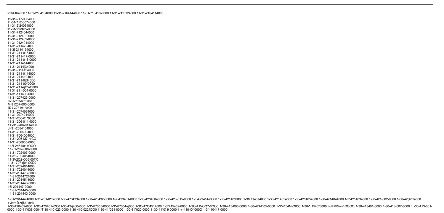
EXHIBIT 5 Service Provider Agreement See attached pages.