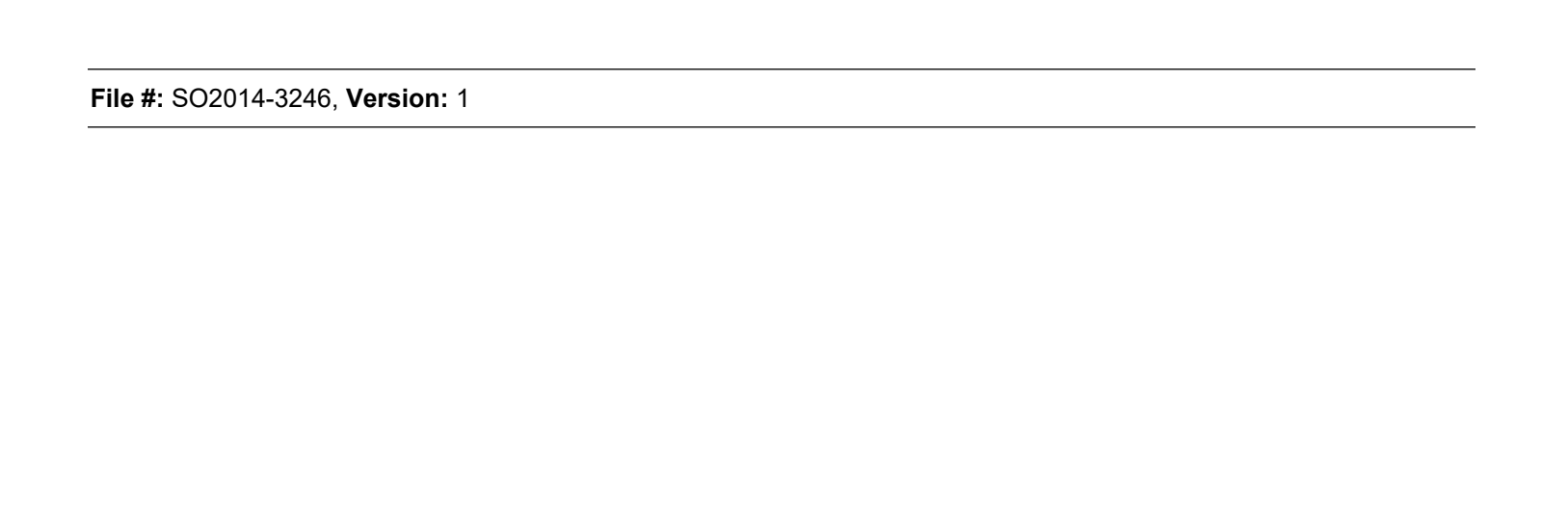
EXHIBIT C Map of the 2014 Amended Project Area See Attached.