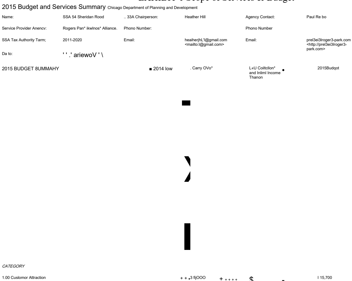
EXHIBIT 1 Scope of Services & Budget