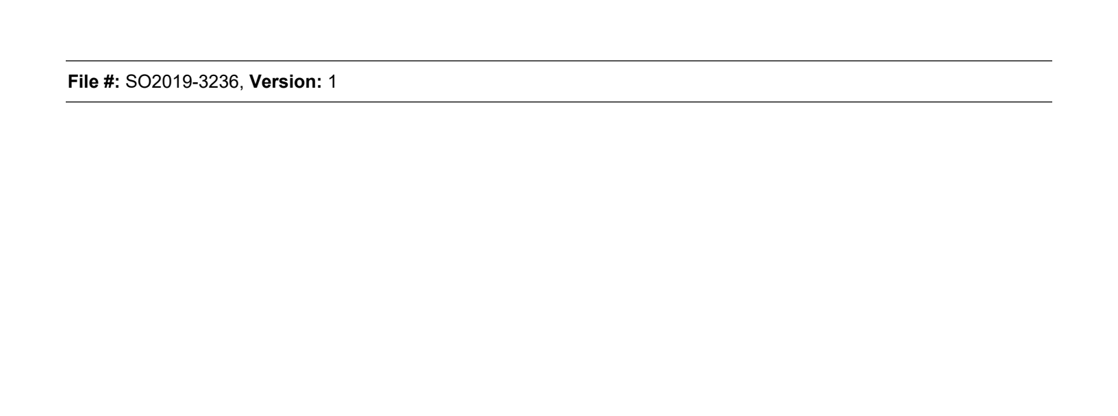
EXHIBIT E CONSTRUCTION CONTRACT

See attached. [NOT ATTACHED FOR ORDINANCE PURPOSES]