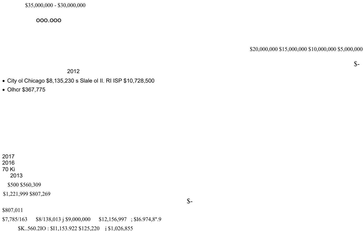
FIGURE 3- PUBLIC FUNDING FOR THE TRUST FUND, 2012-2017 E

Source- OIG summary of the Trust Fund's 2012-2017 audited financial statements