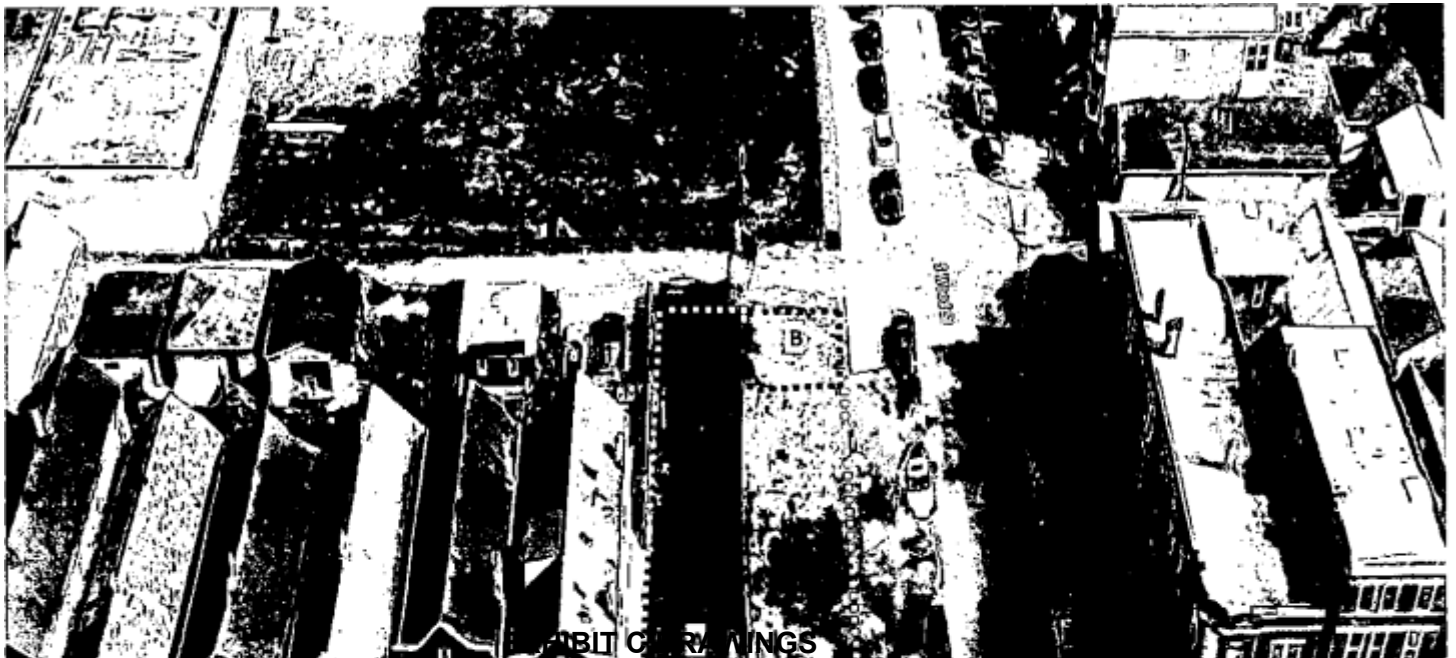
EXHIBIT B DEPICTION OF PROPERTY

HANNA ARCHITECTS 1800 W. 17 th STREET, SUITE 200 CHICAGO, ILLINOIS 60618 TEL: (773) 327-1100 WWW.HANNAARCHITECTS.COM © HANNA ARCHITECTS, INC. 2021