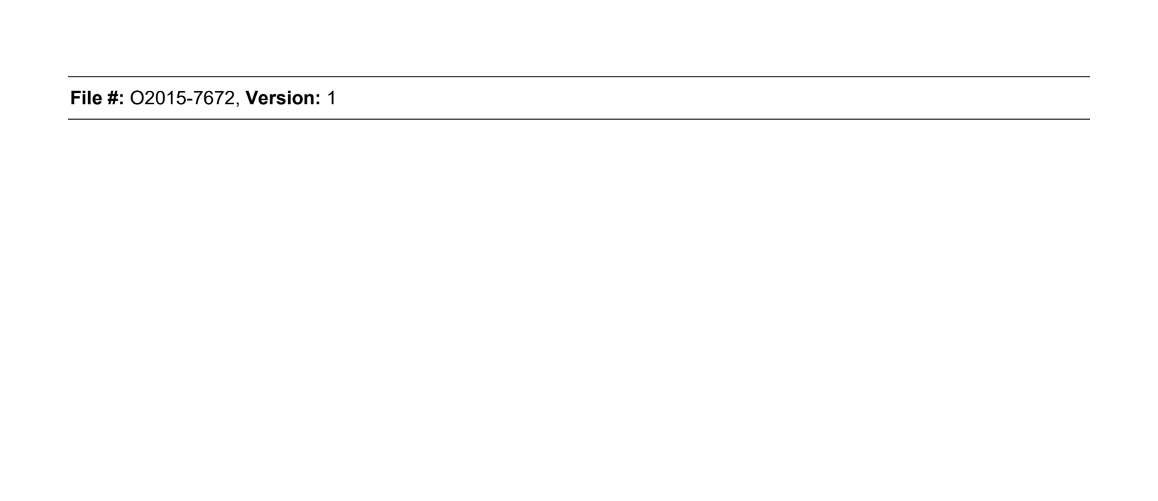
EXHIBIT B CHA Ethics Policy [see attached]