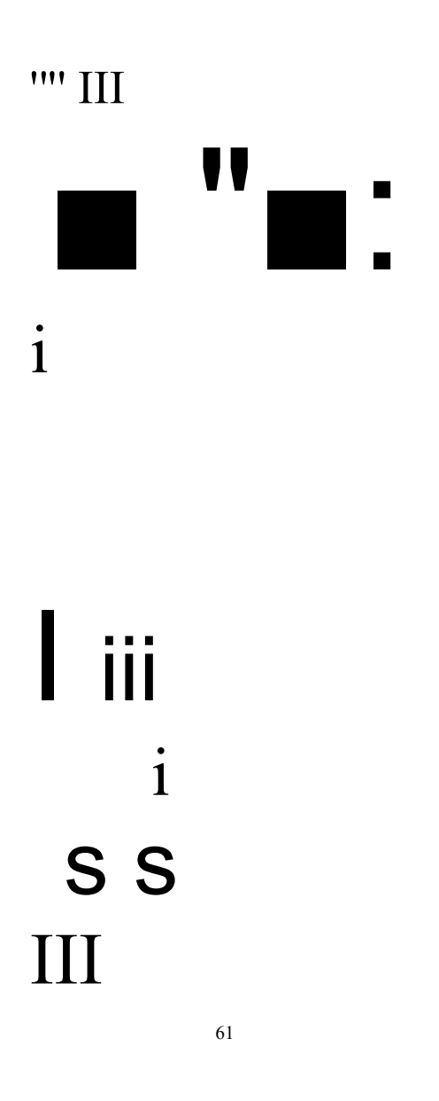
EXHIBIT E CONSTRUCTION CONTRACT [NOT ATTACHED FOR PURPOSES OF ORDINANCE]