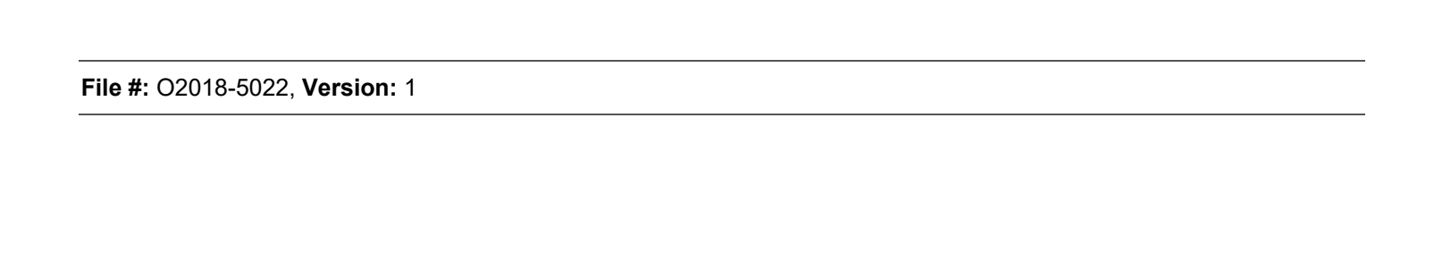
EXHIBIT K Job Readiness Program [to be inserted at closing]