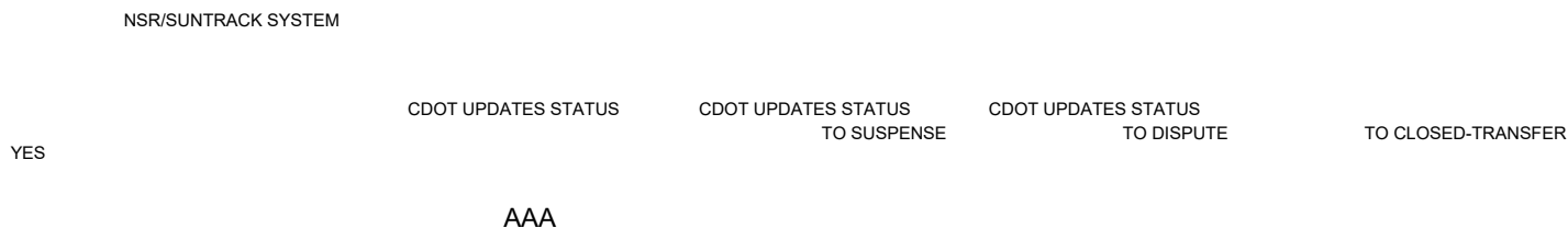
FIGURE 7: AN ESTIMATED 5,880 PERMITS REMAINED STAGNANT AND UNBILLED DUE TO UNRESOLVED PROPERTY OWNERSHIP

Figure 7 depicts the process, as described by CDOT, for resolving property ownership questions (see Finding 1). Note that whether the recipient of the bill pays or not, CDOT continues to bill annually for both current and past clue permit fees This is discussed in Finding 2.