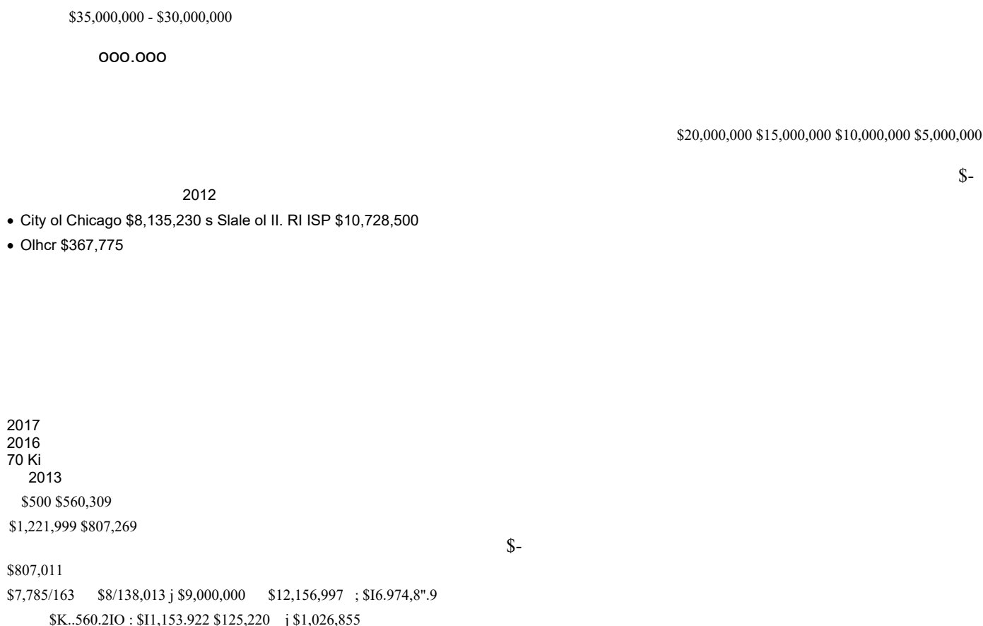
FIGURE 3- PUBLIC FUNDING FOR THE TRUST FUND, 2012-2017 E

Source- OIG summary of the Trust Fund's 2012-2017 audited financial statements